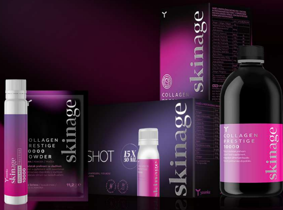
POSSIBLE SOLUTIONS OF PACKAGING: bottle 500 ml, shots 50 ml, vials 25 ml and powder sachets.

TWICE AS POWERFUL FORMULA FOR TWICE AS FAST EFFECT