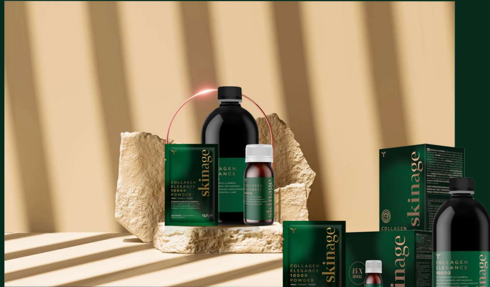
POSSIBLE SOLUTIONS OF PACKAGING: bottle 500 ml, shots 50 ml and powder sachets.